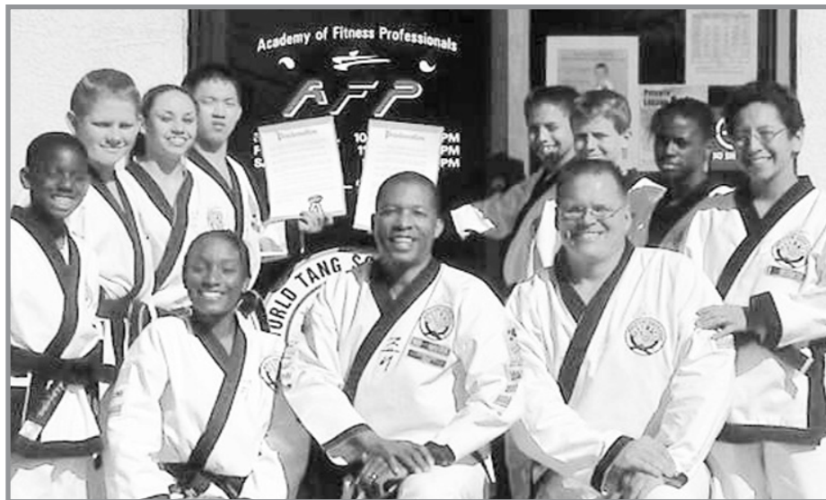
WHAT A GREAT DAY FOR A CELEBRATION The Academy of Fitness Professionals of Sierra Vista celebrated their WTSDA Day Proclamation with a kick-a-thon that raised over $500 for the building fund.